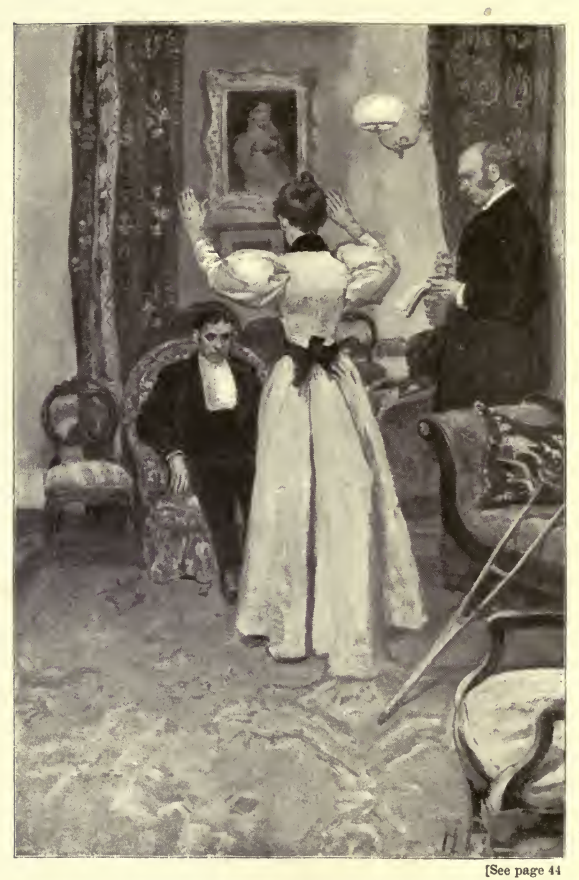
"'I WAS CONSCIOUS ONLY OF HER EYES'"