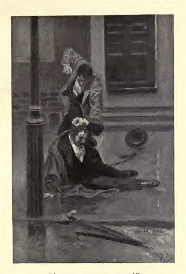
"STRUCK ME WITH BOTH FISTS"