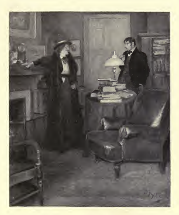
"'OUR ENGAGEMENT IS AT AN END'"