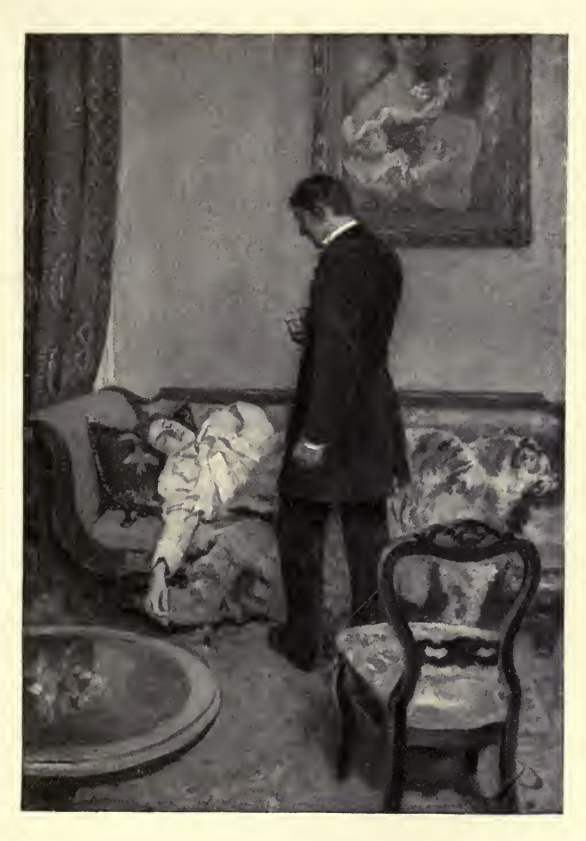
"SHE HAD FAINTED"