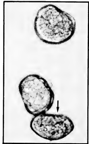
Figure 3. a) P. sterna incipient umbo stage 109 \mu\text{m} DVM and b) P. sterna veliger larvae, one with an abnormally long antero-posterior axis is arrowed (about 60 \mu\text{m} DVM).