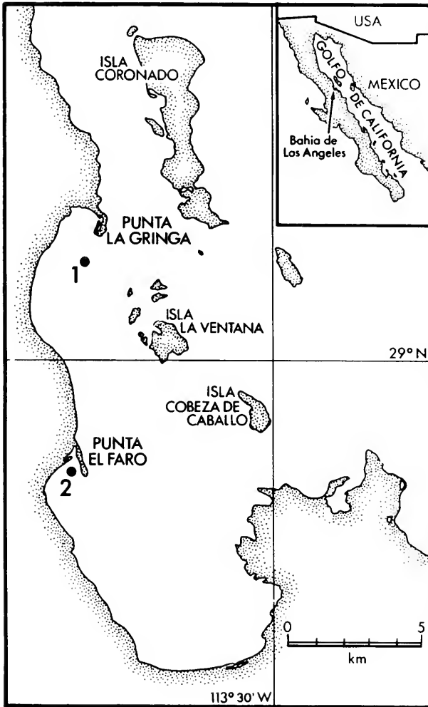
Figure 1. The study locality "Bahía de Los Angeles". Station 1 and 2 are indicated.

in 2 sets of 7 Niester boxes of perforated plastic 60 cm x 60 cm x 9 cm, with 53 individuals in each. The boxes were suspended from a raft at depths between 1.0 and 1.6 m at Station 2 in Punta el Faro and at Station 1 in Punta la Gringa in the south and north of the Bay (Fig. 1). The boxes hung so that each box rested on top of the one below it. Temperature of the surface water was recorded once a month (Fig. 2).